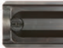
6.3. Fig. 3

Unscrew the front sight screw with the 1.3 mm Allen wrench from the bottom of the front sight. Push the front sight out of the slide. Assembly is in reverse order. Screw in the front sight screw until it is flush with the base of the front sight (6.3. Fig. 3).