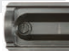
6.3. Fig. 4

Assembly is in reverse order (6.3. Fig. 4). Remember to make sure the screw and the thread inside the steel front sight are free of oil or grease. The thread of the front sight screw should be secured using an industrial adhesive (for example Loctite 648). To tighten the front sight screw, apply a torque of 8.8 inch lbs (1 Nm).