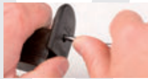
5.2.1. Fig. 1