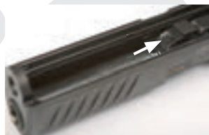
5.1.2. Fig. 1

Note: It is normal for the recoil guide rod assembly to flex when it is installed.