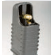
4.2.1. Fig. 3

Put the magazine loader with its long wall oriented to the rear on top of the magazine (4.2.1. Fig. 3). Press down the magazine loader and insert a cartridge with your other hand (4.2.1. Fig. 4). Let the magazine loader go up again. Push in the cartridge completely with your hand (4.2.1. Fig. 5). Repeat the procedure for the number of cartridges you wish to load, up to the magazine capacity.