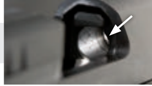
5.1.1. Fig. 4