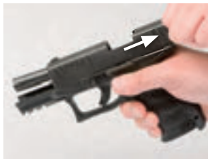
4.5. Fig. 2