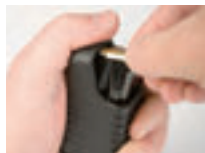
4.2.1. Fig. 4