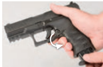
4.1. Fig. 1