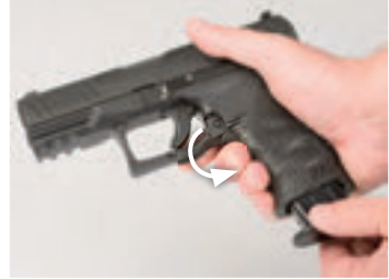
3.2.2. Fig. 1

The magazine release is positioned on both sides of the trigger guard. The magazine release can be manipulated with either your thumb or opposing index finger. Grasp the pistol with your finger off the trigger and outside the trigger guard. Depress the magazine release and remove the magazine. If you find that manipulating the magazine release with your shooting thumb is cumbersome or difficult, try using the index finger of your shooting hand instead (3.2.2. Fig. 1).