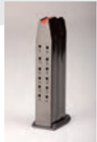
3.2.5. Fig. 1

“+2 Magazines” are available as an accessory item. They hold an additional 2 rounds and provide a downward extension to the pistol’s grip.