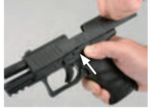
4.5. Fig. 3