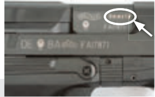
2. Fig. 1

Locate the cartridge designation marked on the handgun. This information indicates the ammunition that must be used in this firearm (see 2. Fig. 1). You are responsible for selecting ammunition that meets industry standards and is appropriate in type and caliber for this firearm.