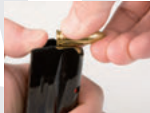
4.2.1. Fig. 2

Load the magazine by pressing a cartridge base (rear of cartridge) downward on the forward portion of the magazine follower (or downward on the case of a previously loaded cartridge) and sliding the cartridge fully under the lips of the magazine until the cartridge base is against the rear wall of the magazine. Repeat the procedure for the number of cartridges you wish to load, up to the magazine capacity (4.2.1. Fig. 2).