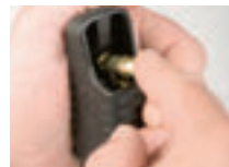
4.2.1. Fig. 5