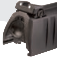
6.3. Fig. 1

If shots group to the right, turn the rear sight windage screw clockwise, if they group to the left, turn the windage screw counter clockwise. Adjustment by one click moves the impact point approximately .7" (2 cm) at a distance of 25 yards (25 m) (6.3. Fig. 1). Replacing the polymer rear sight: