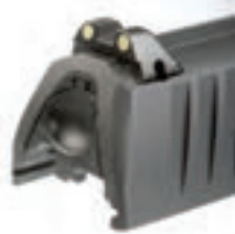
6.3. Fig. 2

Windage adjustments are made by drifting the steel rear sight from side to side with the rear sight adjustment tool. To adjust, move the rear sight in the direction you wish the group to move on the target. For example: if the group should move to the right, move the rear sight to the right.