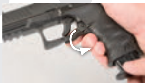
5.1.1. Fig. 1