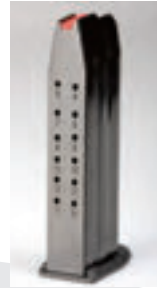
4.2.1. Fig. 1

When the magazine is removed from the magazine well in the grip, the number of rounds can be seen in the witness holes (4.2.1. Fig 1).