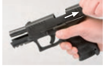
4.1. Fig. 2