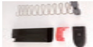
5.2.2. Fig. 1