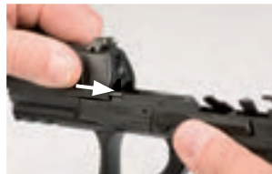
5.1.2. Fig. 3