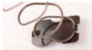
5.2.2. Fig. 2