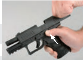
3.2.3. Fig. 1

To lock the slide in the open position, allow the slide to move slightly forward from the rearmost position while pressing upward on the slide stop (3.2.3. Fig. 1).