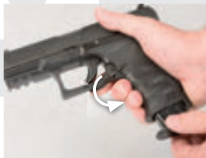
4.5. Fig. 1