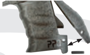
6.1. Fig. 1

To do so, push the pin in the bottom part of the backstrap out using a .15" (4 mm) punch, exchange the backstrap for one with a better fit and replace the pin (6.1. Fig. 1). The PPQ pistol backstraps are offered in sizes Small, Medium, and Large.