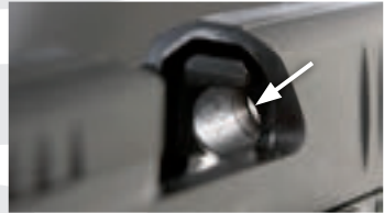
4.1. Fig. 4