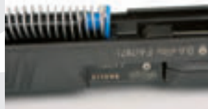
5.1.2. Fig. 2