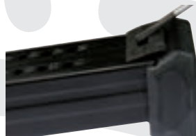
5.2.1. Fig. 2