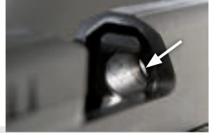
4.5. Fig. 4