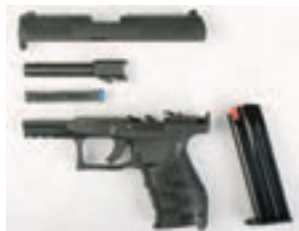
5.1.1. Fig. 7