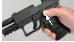
5.1.1. Fig. 3