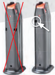
4.2. Fig. 1