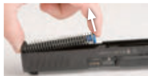
5.1.1. Fig. 6