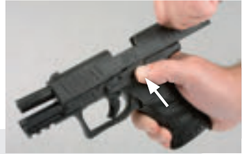
4.1. Fig. 3