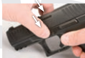
5.1.1. Fig. 5