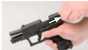
5.1.1. Fig. 2